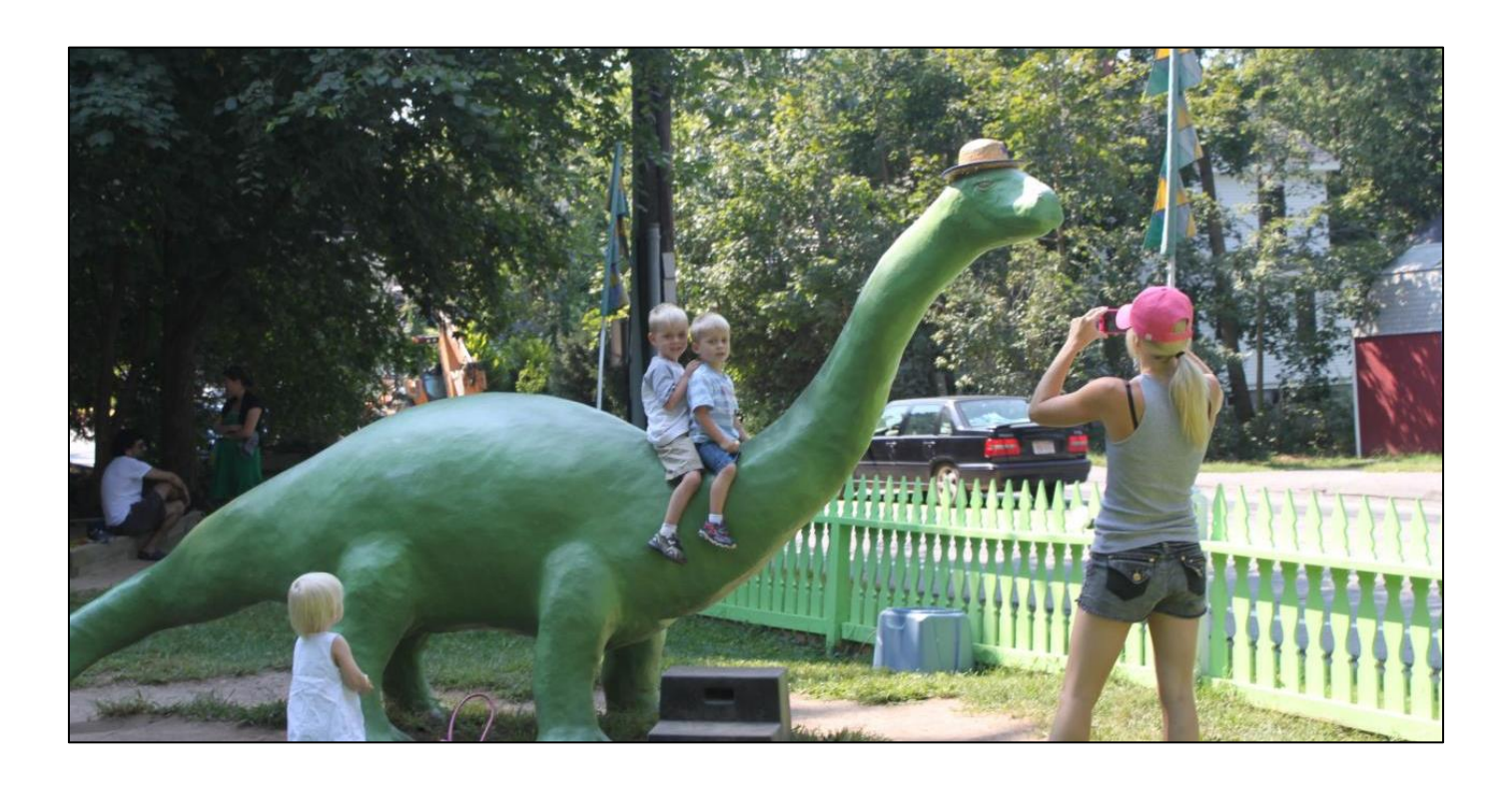
What a fun day!

I will wave goodbye to Bessie and maybe even take a picture with her.