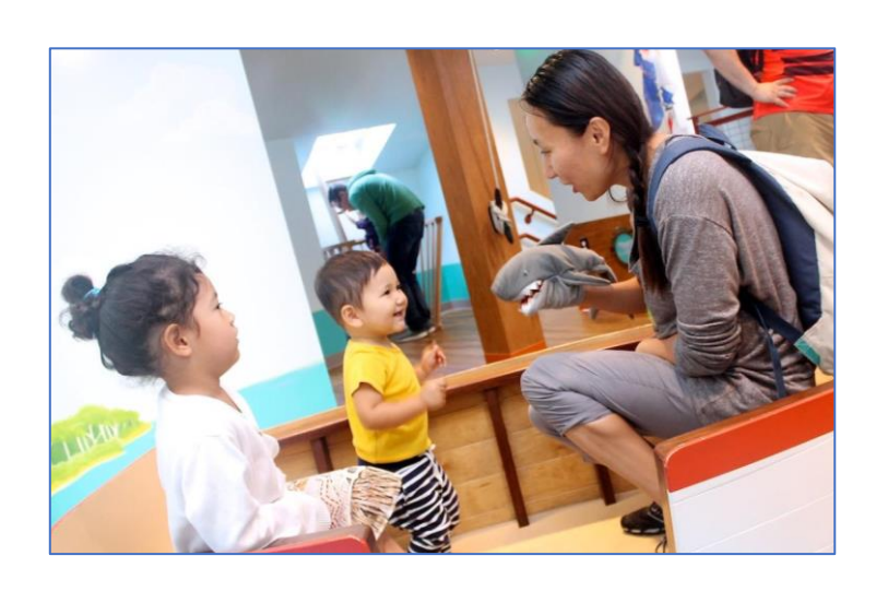
I can sail over the ocean.