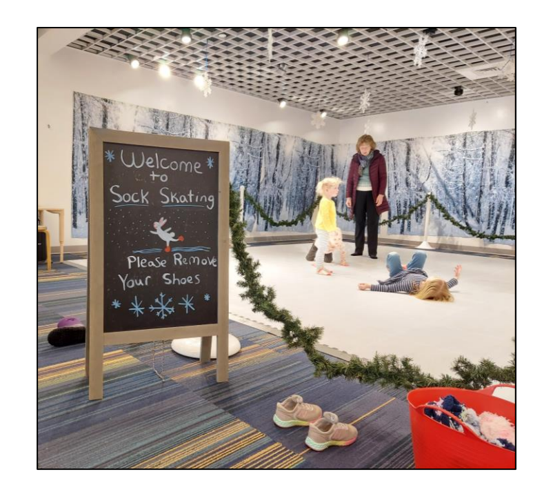
Sometimes there will be special activities to try.