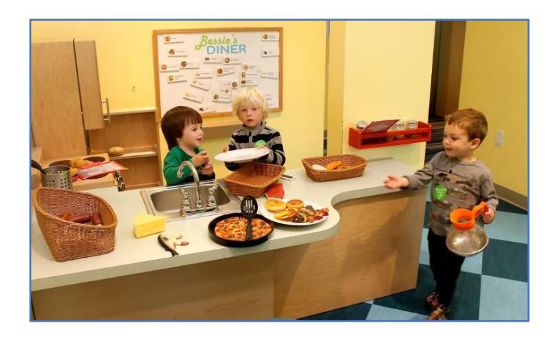
I can cook a meal.