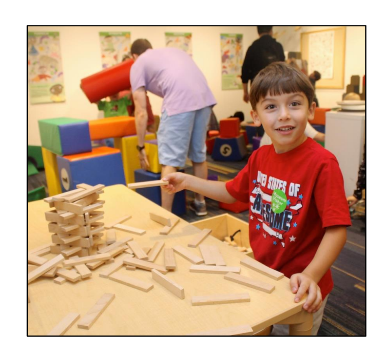
Sometimes there will be blocks and other things to build with.

I wonder what will be there when I visit?