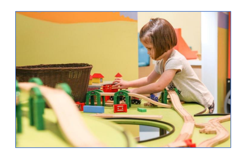
I can play with trains .

Bessie's House has lots of special rooms for me to pretend in.